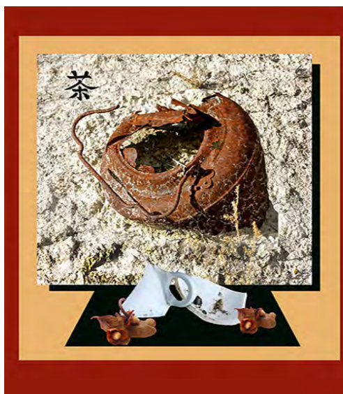
Tea Pot & Cup and Gifts Photographs