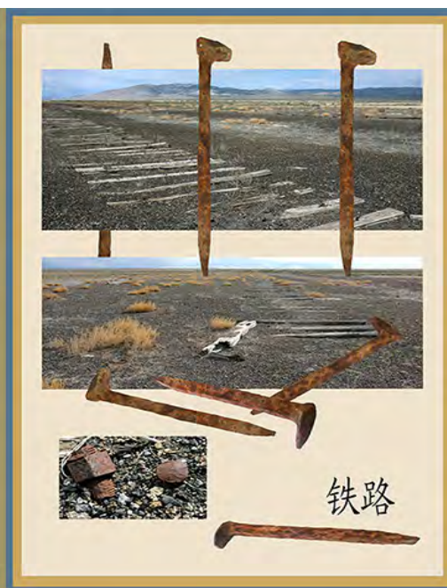
By Roz Newmark