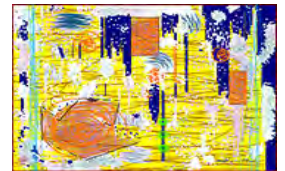
“June 17, 2013”