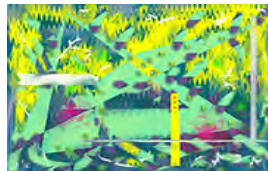
“May 25, 2013”