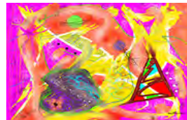
“June 4, 2013”