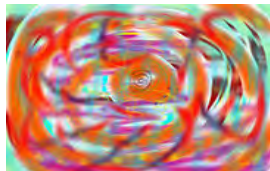
“May 24, 2013”