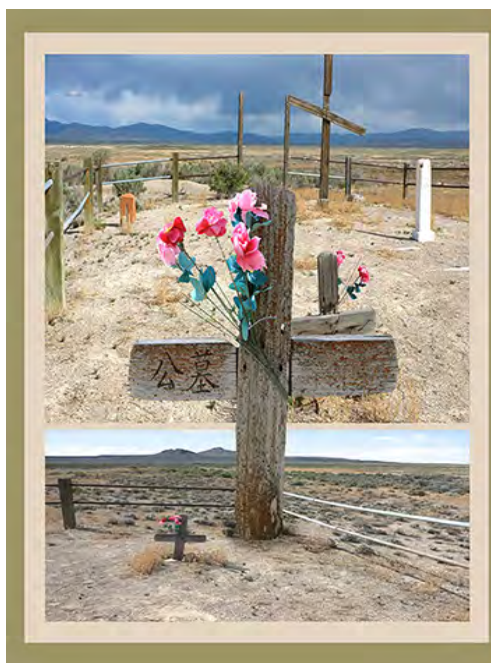
Cemetery and Railroad Photographs