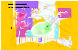
“May 17, 2013”