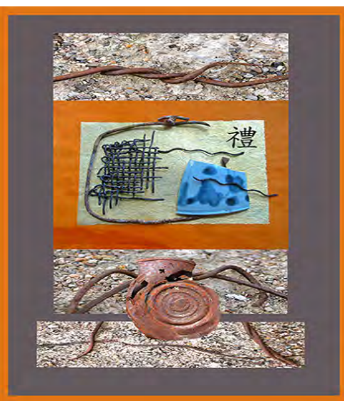
By Roz Newmark

From Delta we meandered north exploring a number of sites, most offering only a whisper of their past inhabitants. I began to think we'd have to plan another excursion in order to find a ghost town that would provide enough inspiration for a project. As we continued north we visited the Sun Tunnels and the ghost town of Lucin. Finally, we stopped at the last ghost town on our list, Terrace, Utah. Prowling the grounds there, we found hundreds of pieces of colored glass, rusted metal, bricks and railroad ties. A cryptic hint of a once active community. Almost immediately I felt this was the site for my project.