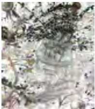
Roses in Vase