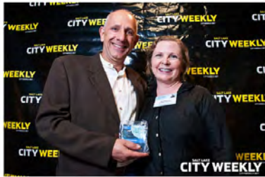
Another Language Performing Arts Co. Duel•Ality 1.0 was awarded the Salt Lake City Weekly's 2011 Artys Staff Award for "Best Mixed-Media Performance Art"

Every year, the Salt Lake City Weekly acknowledges the artistic community with the Artys awards. This year, Another Language Performing Arts Company's Duel•Ality 1.0 was the recipient of a staff award for Best Mixed-Media Performance Art . Thanks to all who voted for the company's work, and thanks to City Weekly for this acknowledgement.