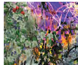
Fire and Water